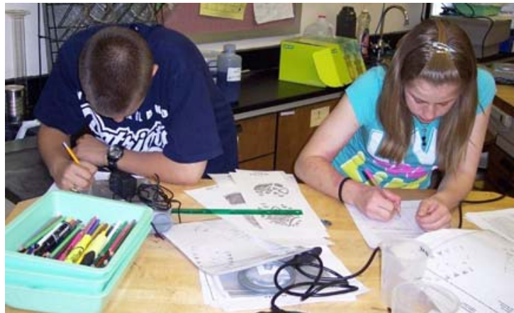
Danville students analyze fingerprints in their Crime Scene Investigation.