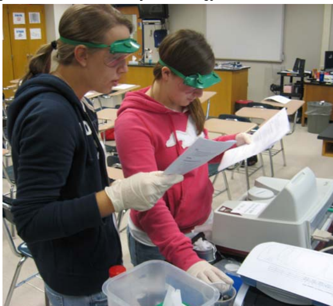
South Williamsport High School chemistry students try to determine the identity of unknown organic liquids.

At Shikellamy High School , the physics students of Colleen Ruths performed the lab Ohm's Law . Her students used the Vernier circuit boards, differential voltage probes and current probes to determine the relationship between current, voltage and resistance in a circuit. The students also performed the lab Series and Parallel Circuits . They studied current and voltages in series and parallel circuits using the Vernier circuit board. In addition, the students used the circuit board to perform the lab Capacitors where they measure an experimental time constant of a resistor-capacitor circuit and compare it to the value predicted from the component values of the resistors and capacitance.