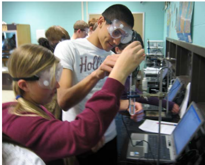
Selinsgrove High School students produce acid rain in the lab and then test the pH level of that acid rain.

The end of the school year is quickly approaching. I am glad to have been able to visit many of your classrooms so far and I look forward to seeing those of you who still have scheduled visits with me coming