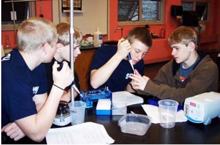
Shikellamy students work together to load DNA Fingerprinting gel.

Spring is finally here . . . maybe even summer as the temperatures go up! April began and ended with Crime Scene Investigation . Mary Dahlmann at Shikellamy High School used the crime scene lab with