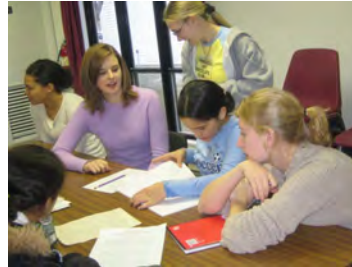
Latino youth get help with homework at the Pine Meadows after school Program.