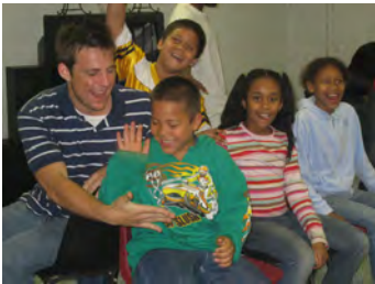
Latino youth enjoy fun and games with SU students at Pine Meadows.

(Private Dining Rooms 2 & 3) (By invitation only)