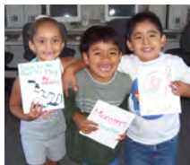
In Sunbury, Latino youth are "all smiles and full of pride" after completing a writing activity.

"The XIII Latino Symposium explores the exile and immigration experiences of Spanish speakers who have crossed many borders to enter the United States. It also celebrates the numerous ways in which Susquehanna University students have themselves crossed linguistic, cultural and geographical borders in order to create bonds of support with Latinos in this region and far beyond. "