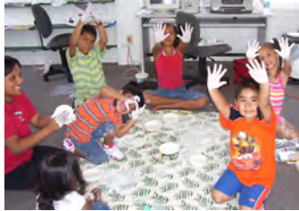
Sunbury students in the summer enrichment program enjoy a "hands-on" activity.

"The XIII Latino Symposium explores the exile and immigration experiences of Spanish speakers who have crossed many borders to enter the United States. It also celebrates the numerous ways in which Susquehanna University students have themselves crossed linguistic, cultural and geographical borders in order to create bonds of support with Latinos in this region and far beyond. "