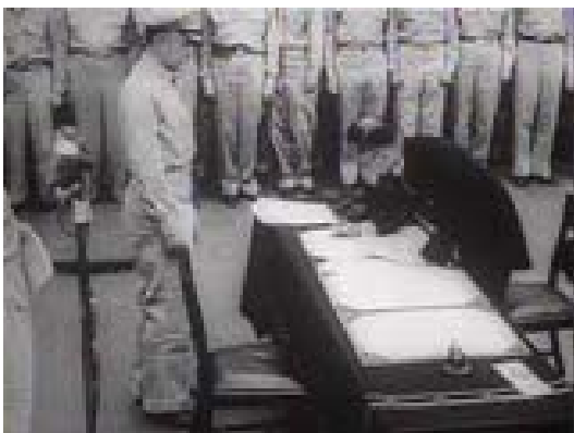
Japanese Sign Final Surrender