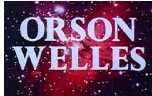
Who's Out There? 1975

This clip shows the signing of the Japanese surrender documents aboard the Battleship Missouri in the Bay of Tokyo on Sept. 2, 1945. It includes shots of Personages: Foreign Minister Mamoru Shigemitsu and Gene Yoshijiro Umezo of Japan; General MacArthur; General Wainwright; Brit. General Arthur Percival; Admirals Halsey and Nimitz; Chinese General Hsu Yung-Ch'ang; British Admiral Bruce A. Fraser; Russian General Kuzma Derevyanko and others.