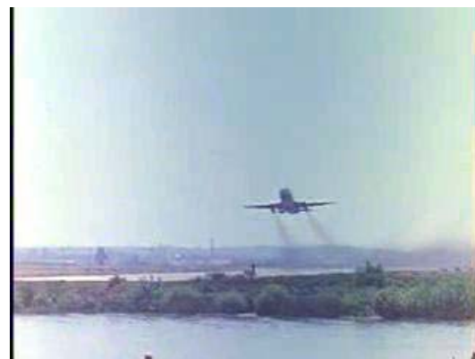
Children of the City 1970

extraterrestrial life from the results of probes to the planets. The film discusses the conclusion of a number of distinguished scientists that other intelligent civilizations exist in the universe.