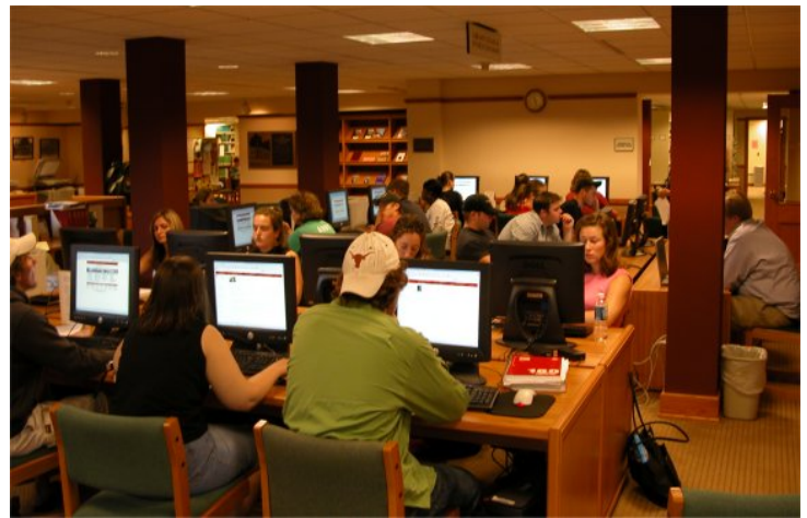
Students doing research in the Library in 2008.