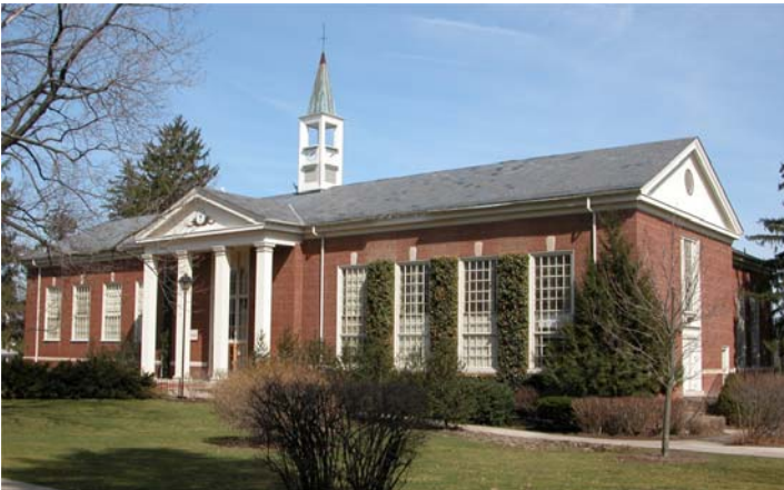
The Blough-Weis Library in 2008, entrance facing West.