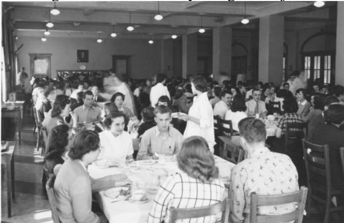
Students enjoying a meal, served family style, at assigned tables in SU's Horton Dining Hall. (Circa 1940s)