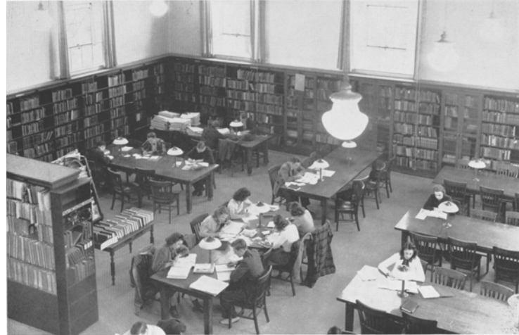
Students were hard at work in the Library in 1945.