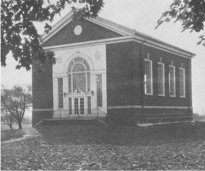
The original Library building in 1929, with the North entrance.

"In books lies the soul of the whole pastime." -CARLYLE.