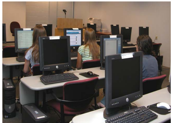
Library Instruction Lab is now open for student use after classes

In response to student requests for more PCs in the Library, we are providing access to the PCs in Instruction Classroom (Room 01) in the Media Center after class hours. The Room will be open for use as a lab for students from 4pm to closing, Mon-Friday, and all day Saturday and Sunday while the Library is open. WORD 2007 has been installed on these PCs. This makes 20 additional PCs available, bringing the total number of PCs and laptops for student use to 107.