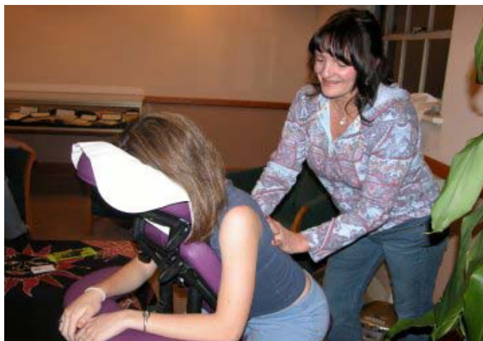
Ahhhh.....That Feels Good

Two professional massage therapists conducted stress-relieving chair massages in the Reference Lounge,