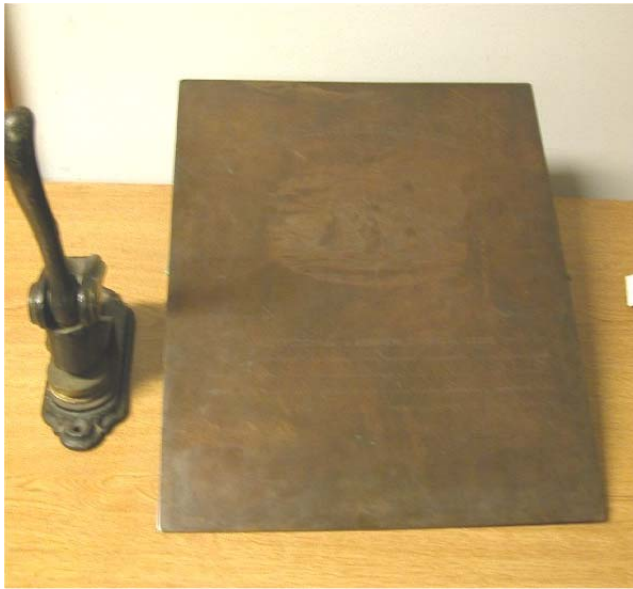
Diploma Press and Seal from Susquehanna Female College

When the Missionary Institute was founded in 1858, the Susquehanna Female College was also founded, as a “sister” school, located on Market Street in downtown Selinsgrove. The Susquehanna Female College closed its doors in 1872, and the students were transferred to the Missionary Institute, ushering in an era of co-education that continues to this day.