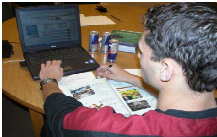
Soft Drinks...in the Library??

Also available during the hours were peer tutors employed by the Office of Tutorial Services to help students in writing, mathematics, and foreign languages.