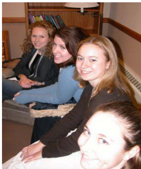
Students Relax in a Quiet Study Area

During the event, special areas geared to helping students relax and simply take "study breaks" were provided throughout the Library. Many of the Library's study rooms were occupied by small study groups and individual researchers.