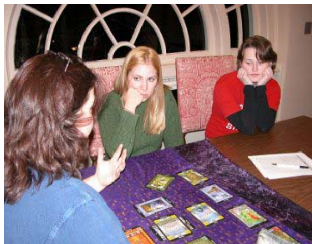
So, Tell Me! Will I Pass my Chem Final?