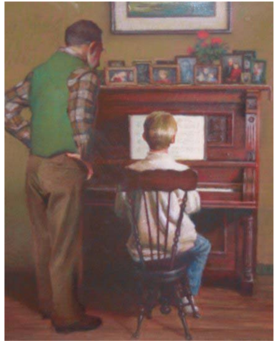
Piano Lesson (Pastel)