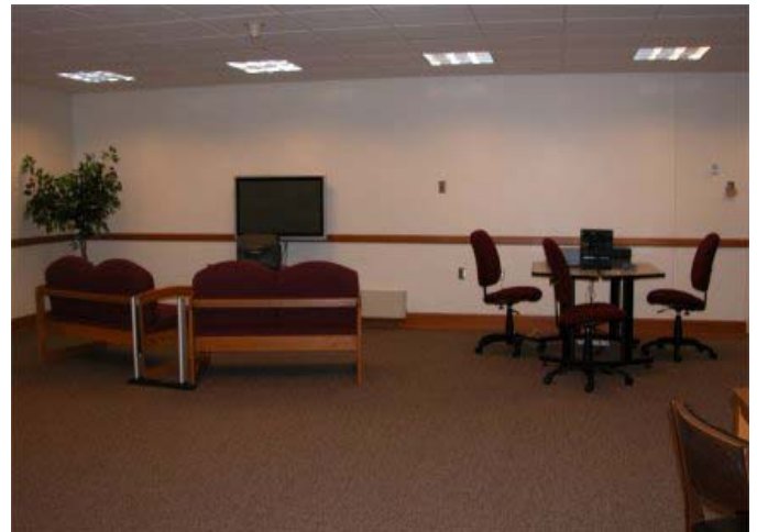
Multimedia Center Viewing Lounge