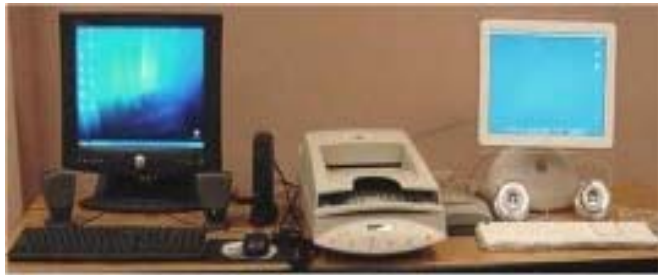
Instructional Technology Center Equipment

capture audio/video clips to be inserted into web pages or incorporated into class presentations, e.g., with the use of Power Point. This PC is also equipped with a variety of software applications.