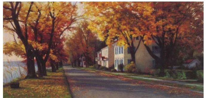
Isle of Que - Autumn (Print)