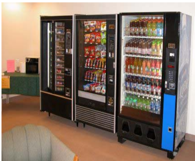
Vending Machines in the Library Snack Bar

The coffee machine should be delivered in the next two weeks, and the new furniture shortly thereafter. A new doorway beyond the newspapers leads to this snack area.