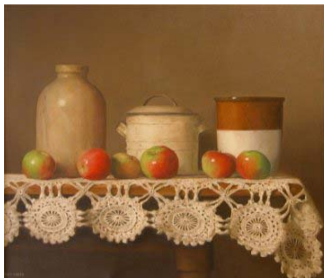
Still Life with Apples and Crock (Oil)