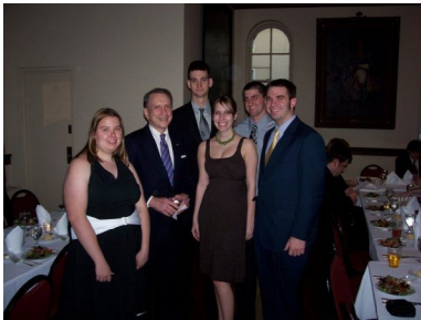
SU College Republicans with Senator Specter

As my committee and I have begun planning, we’ve run into a few financial boundaries. Although our organization is the only politically active organization on campus, we don’t have much of a budget allotted for events such as this. We would greatly appreciate anything anyone could donate to help us spread the word about abortion, and more importantly, possibly save a life.